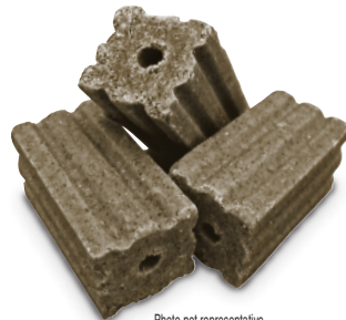
Photo not representative of a label placement.